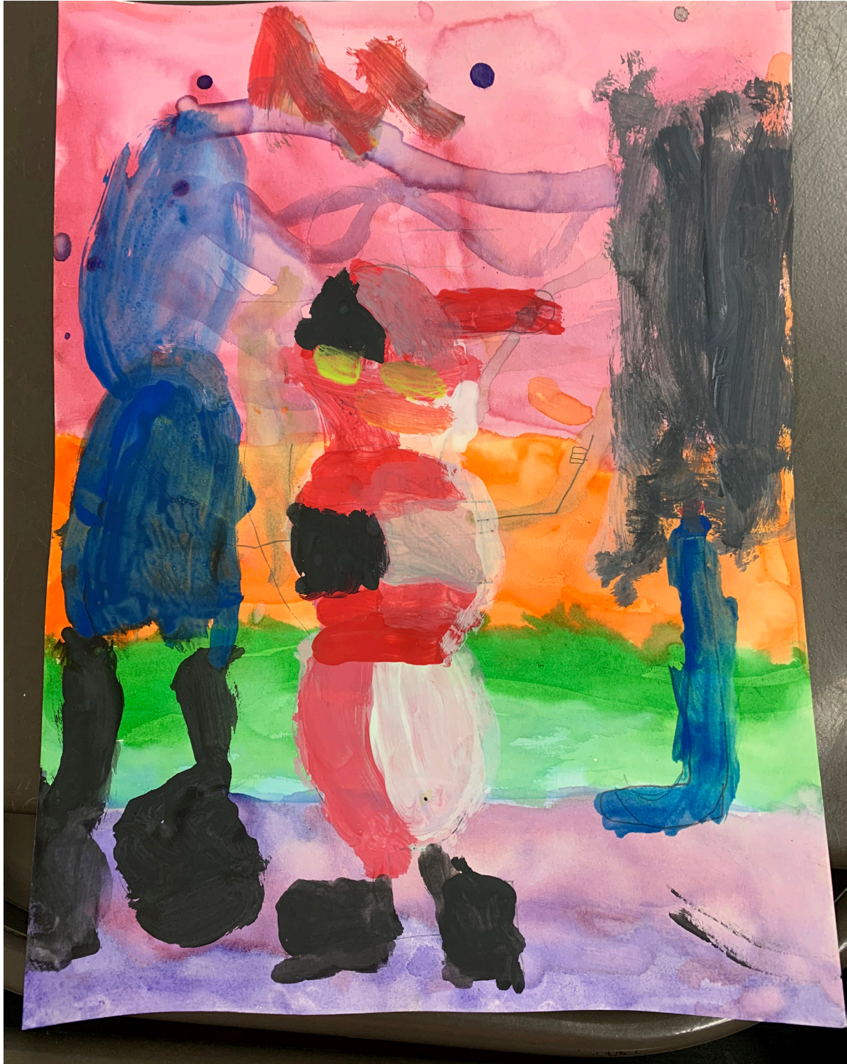
STUDENT 2 WORK SAMPLE LESSON 3 FINAL PROJECT